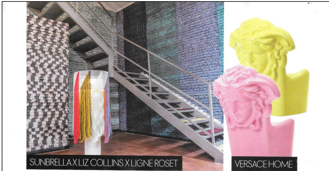
SUNBRELLA X LIZ COLLINS X LIGNE ROSET